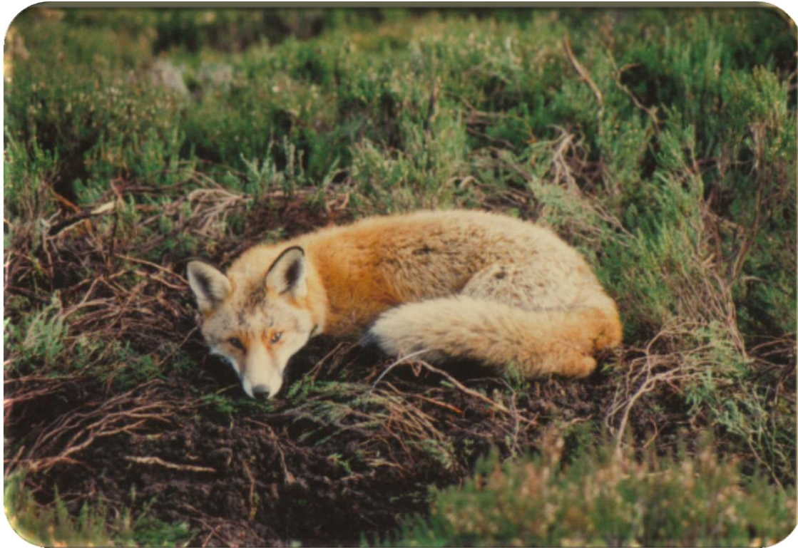
Figure 1 - Fox held in snare

Snaring is a skilful, selective and humane method of restraining an animal until the animal can be either released unharmed or humanely despatched, as appropriate. Fox snares are made from wire and are designed not to cause damage to a restrained animal.