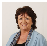
Rona Mackay Scottish National Party