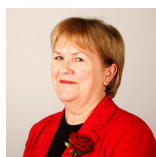
Convener Johann Lamont Scottish Labour