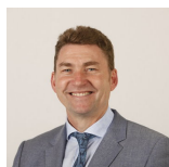
Brian Whittle Scottish Conservative and Unionist Party