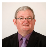
Deputy Convener Angus MacDonald Scottish National Party