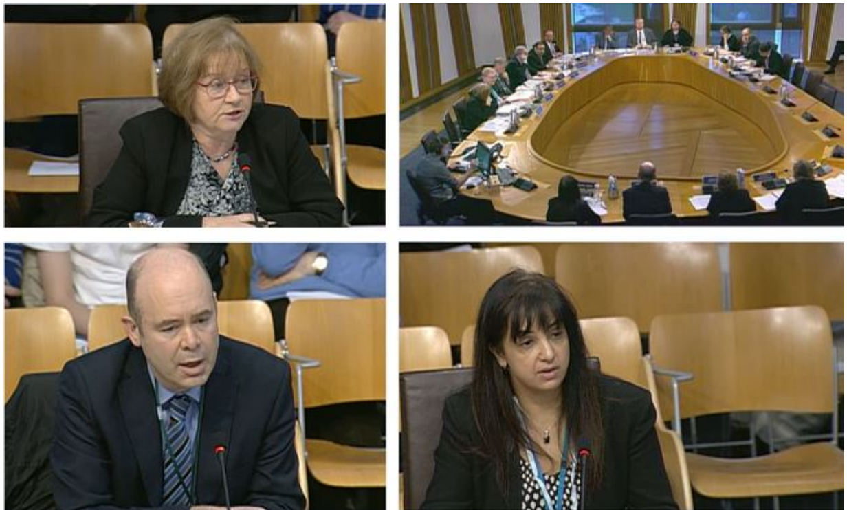
Figure 7: Evidence session with the Scottish Government on 9 February 2016